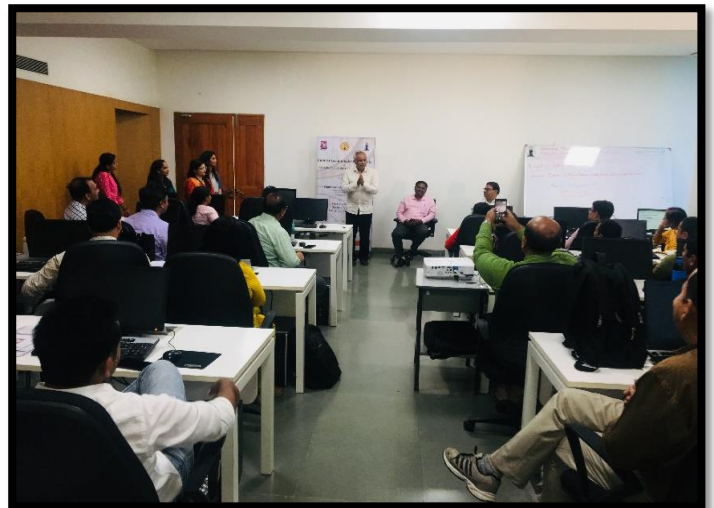
(Participants are thanks to GTU and INFLIBNET center and share their experience during the training)