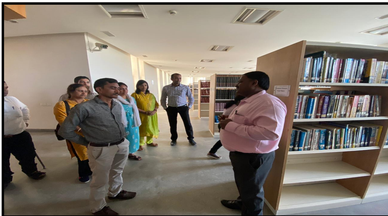
(Visit at INFLIBNET Library)