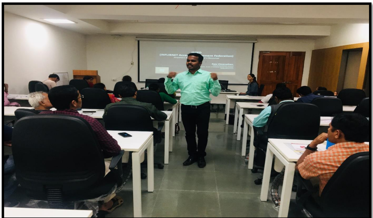
(Lecture delivered on INFED by Sh RAJA v scientist-B )