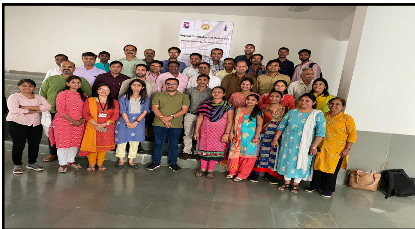
(Group photo of Stakeholders of STTP)