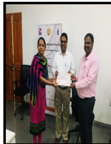
(Certificate Distribution Function)