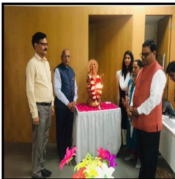
Inauguration of STTP by VC Sir of GTU